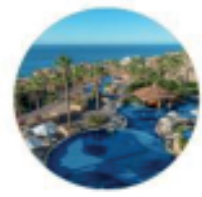
Pueblo Bonito Sunset Beach Golf & Spa Resort

Overlooking the Pacific Ocean, luxury and the tranquility of the Old World welcomes those who are present.